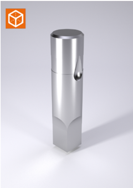
2722. Ball-Lock punch, stepped, square, with ejector pin, light duty