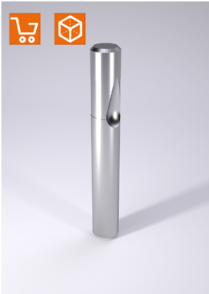
2703. Ball-Lock punch, blank, with ejector pin, heavy duty