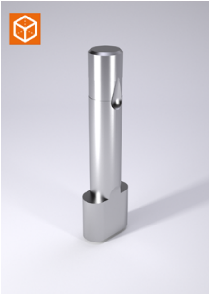
2744. Ball-Lock punch, punch larger than shaft, slot, with ejector pin, light duty